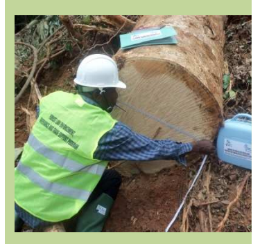
A representative of BAKA indigenous peoples measuring an unmarked tree.